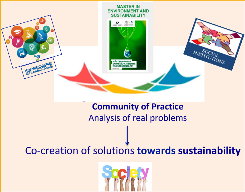
Figure 3. Strong partnerships between the University and Social organizations

Creation of strong partnerships between the University and various private and public organizations: NGOs, enterprises, Town Halls, Regional Government, United Nations system's offices