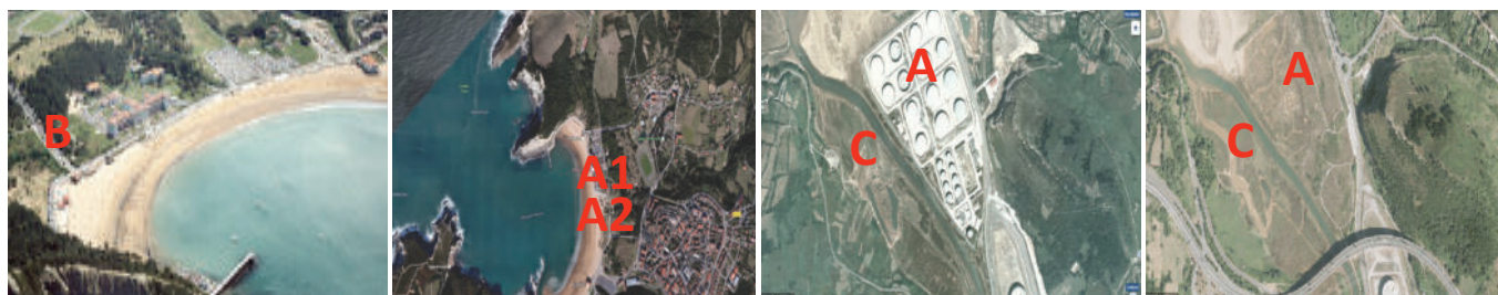
Figure 1. Restoration sites: sand dune restoration before the car park in 2009 (A) and restaurant in 2015 removal (B) (left) and saltmarsh restoration before the refinery deposits removal (left) and after (right). In the salt marsh the red letters show the recovered site A and the control site C.

The methodology followed in both projects was quite similar, based on transects and using 2x1 m quadrats as sampled units. In both studies plant species cover was estimated using a semi-quantitative of frequency-abundance that shows the cover following the DAFOR scale in ranges 1 to 5 (Joint Nature Conservation Committee 2004). Shannon and Simpson diversity indices (Magurran 1989) were calculated in the sand dunes following the zoning from the lower zone to the higher zone, further from the sea. The nomenclature followed was that of Flora Europaea (Tutin et al. 1964-1980), except for Tortula rurales (Hedw.) Gaertn species.