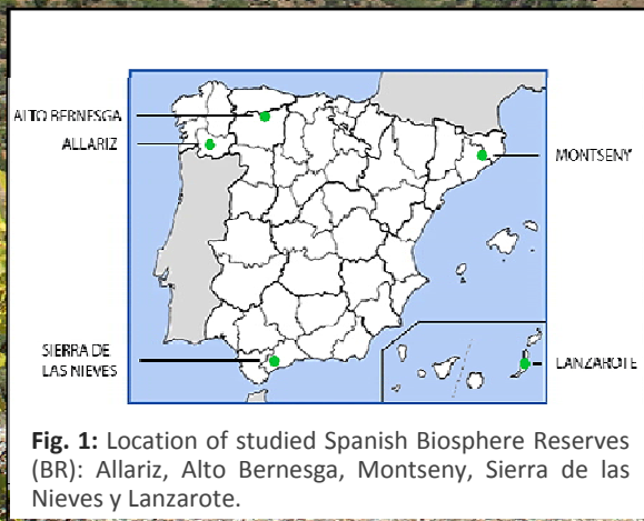
Fig. 1: Location of studied Spanish Biosphere Reserves (BR): Allariz, Alto Bernesga, Montseny, Sierra de las Nieves y Lanzarote.

A synthesis of conclusions of five experiences of the Spanish Network of Biosphere Reserves is presented (Area of Allariz, Alto Bernesga, Montseny, Sierra de las Nieves and Lanzarote) (Fig. 1).