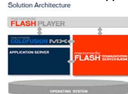
Figure 1 Solution Architecture of Macromedia

presentation on the Internet. With the rich media messaging features, such as multi-way, multi-user video and audio chats, the engaging live human interactions and instant messaging are added to the design. The real-time collaboration features, including the Shared Object technology, enable multiple users to share live white boards and other real-time data in the context of an application.