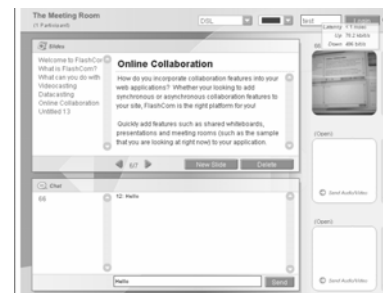
Figure 2 Sample Design of purposed architecture

The live streams and all the actions on the screen will be recorded and stored in the database so that the students can access and retrieve recorded lesson. With Oracle database up to 4 GB data in a same field. Each course is assumed to be 1 hour: this will result with 1.3 GB data to be stored in a data base including all on screen activities of a live multicast.