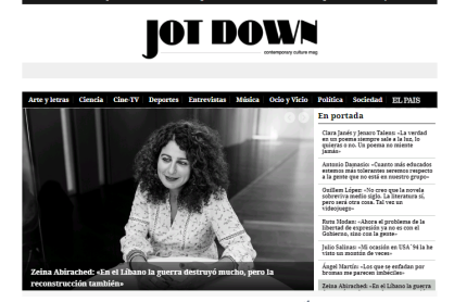
Home page of Jot Down from 10<sup>th</sup> July 2018.

The majority of narrative press consumers are looking for news about politics (56%), culture (55%) and science and technology (50%). In Colombia (58%) and among those with a post graduate university degree (66%) consumers also seek opinion, whilst the youngest age group are more interested in society issues (50%).