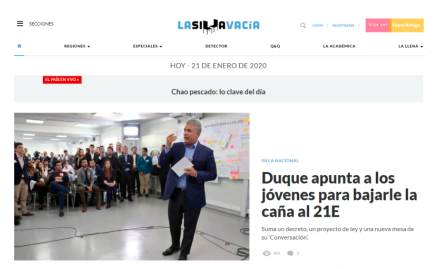
Home page of La Silla Vacía from 21<sup>st</sup> January 2020.

There is a higher proportion of people who have had or maintain a subscription to a printed news medium (34%) than to a digital one (24%), and, in this sense, Colombia as a country stands out, as does the age range of 50 - 65.