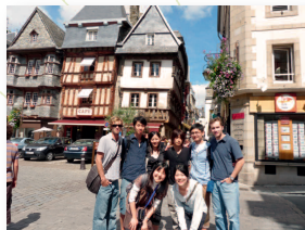
Medieval houses in Lannion