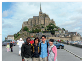
Mont Saint-Michel Unesco World Heritage