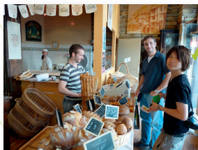
In a typical French bakery