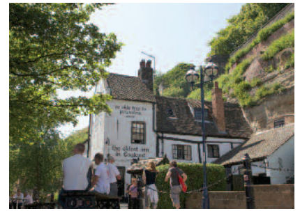
Ye Olde Trip to Jerusalem