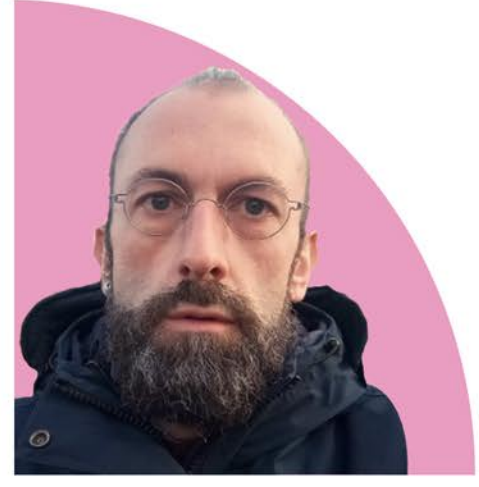
10:00 Thursday, June 1st 2023