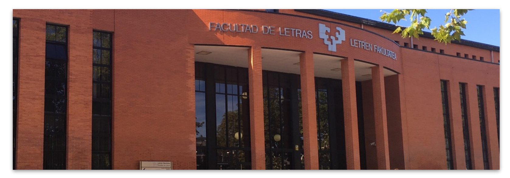
Faculty of Arts, University of the Basque Country (UPV/EHU)

During the on-site week, from May 13 to 17, several sociocultural agents from the Basque Country, representatives of associations, NGOs or cultural institutions such as the UNESCO Etxea or the Etxepare Euskal Institutua , will participate in the course. In a workshop designed and animated by Hibridalab ,