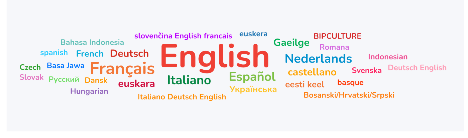
Word cloud with languages spoken by participants

All online sessions take place via Teams on Friday from 10:00 to 13:00 (UTC+1 = Brussels) (9:00-12:00 in Ireland; 11:00-14:00 in Estonia).